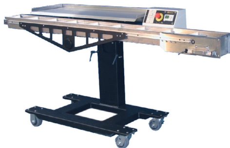
Optional loading in-feed conveyor