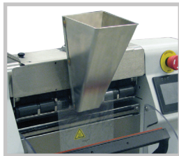
Optional loading funnel