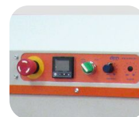
Precise temperature and speed control panel