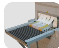
Optional exit conveyor