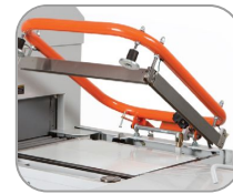
Temperature controlled seal system for reliability and consistency