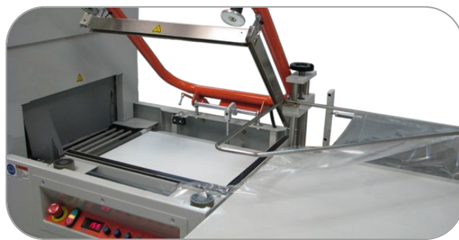
Load product from the side with greater ease and faster time with the optional inverting head with power film unwind